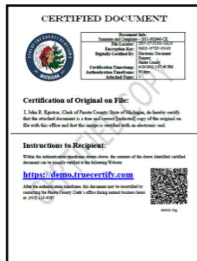
Figure 6 - TrueCertify

Lastly, JusticeTech Clerk is part of a suite of solutions that integrates with the court, judiciary, prosecution and public safety offices, providing a true enterprise solution. JusticeTech Clerk is a key component in creating a 100 percent electronic court.